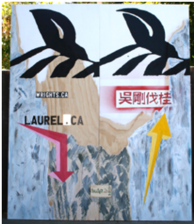
Above: Version of Laurel painting including laurel leaf symbols; references to California ghost towns of Wrights and Laurel; Chinese text referring to Wu Gang chopping down an ever growing laurel tree—a Sisyphus-like myth; and the formula for Heisenberg's uncertainty principle.

Receptions held during First Friday art events on 2/6/2015 and 3/6/2015