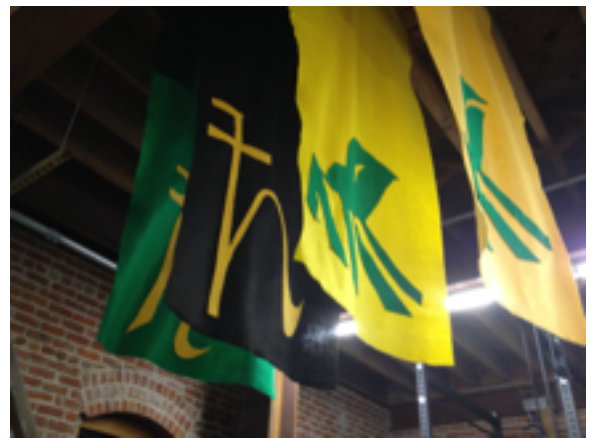
Left: Banner after Nicholas Roerich's "Banner of Peace." For Roerich the three dots symbolized Art, Science, and Religion. Above: Banners displaying open and closed laurel leaf symbols and the symbol for the reduced Planck's constant.