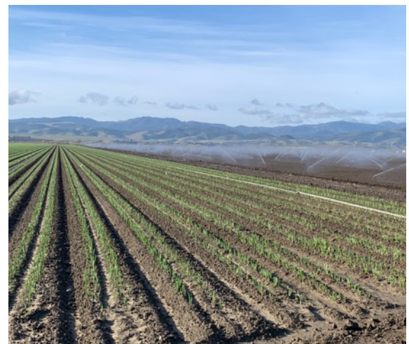
Between the furrows and the mountains sits Lesnini Field