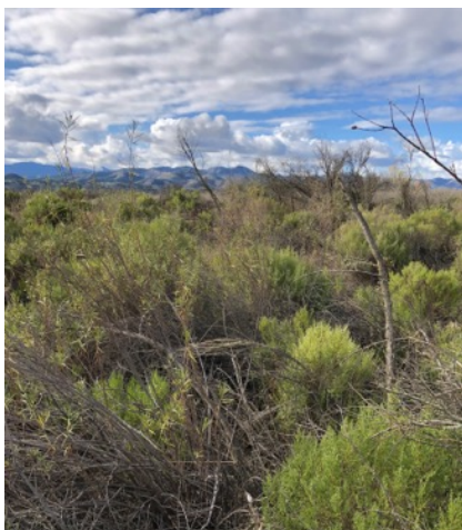
Looking into an inaccessible ravine of vegetation

Work started on the second day with collecting one cubic meter of plastics and disposing of nearly all preconceived ideas about artworks and landscaping. Out in the open in the center of the 22 miles of panopticon it was a joy to have done nothing and a relief to decide to refrain and yield to the extant.